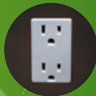
A power supply

All you need to charge your rechargeable Spectra WaveWriter™ stimulator is: