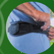
The charging belt