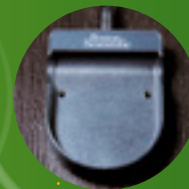
The base station